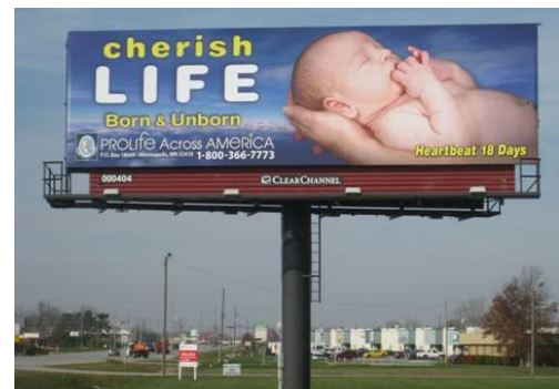
14'x48' on Brookville Rd and about Post Rd

Update, as of now, the 14' x 48' Pro-Life sign's contract (on Brookville Road & Post heading west) has expired, but it is still up. Monthly rental is $750/month on the 14' x 48' sign. If interested, please contact me.